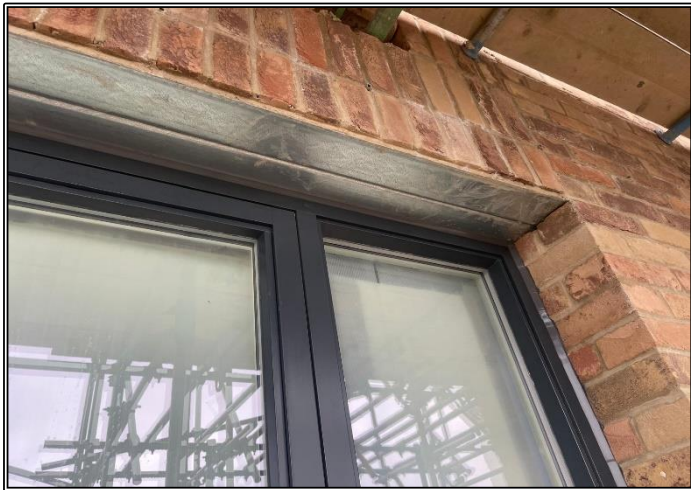
Benchmark Plot External Mastic