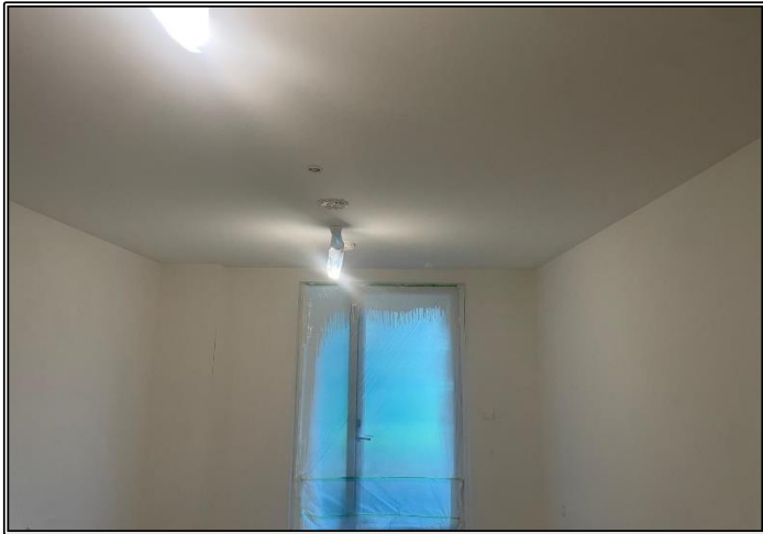
Benchmark Plot Second Coat