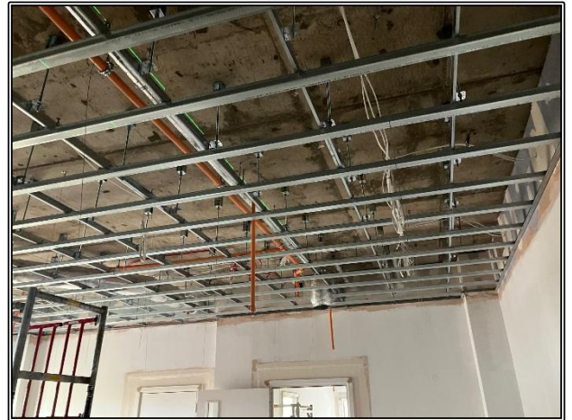
Nursery Acoustic Ceiling Grid