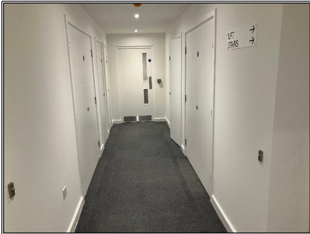
Corridors Cleaned and Snagged