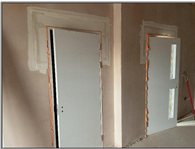
Nursery second fix